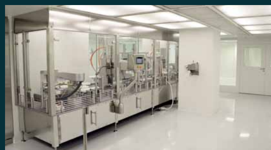
GMP A / ISO 5 Cleanroom with automatic filling machine