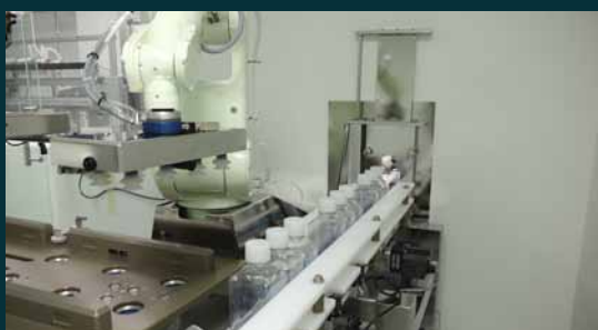
The roboter arm is part of the automatic filling machine